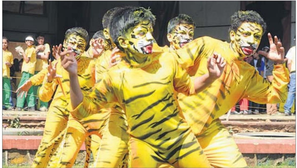
(Above) Tiger dance performance by school children at the Aircel Kids for Tiger fest. (Right) Winners of a sit and draw competition, organised by Amway, being felicitated.

Initiated by Aircel in 2008, the 'Save Our Tigers' project is a key CSR ini-